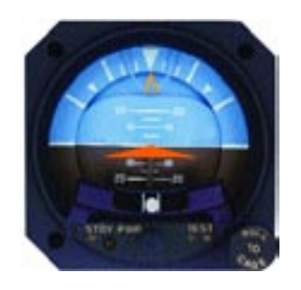
Mid-Continent Instrument Co.'s 4300-413 with inclinemeter

Instrument's 4300 series Lifesaver Gyro electric attitude indicator with built-in battery backup. If you've ever had a vacuum or electrical system failure, this unit has to be really high on your "gotta' have list."