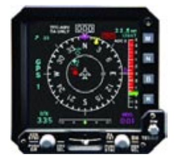
Rogerson Kratos EFIS 520 includes TCAS II

According to the company, the EFIS 520 is "fully loaded," which means it includes TCAS II, EGPWS/TAWS and GPS display capabilities as standard features.