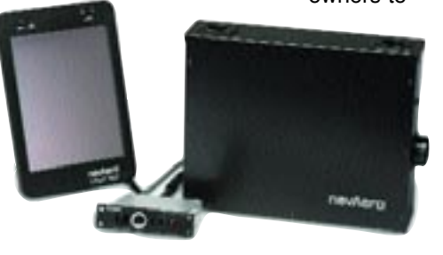
navAero T•Bag C2 Electronic flight Bag

If you've got your heart set on a high-end Electronic Flight Bag (EFB), check out the newest offering from NavAero—the all new t•Bag C2 EFB. The company describes it as "the most cost effective way for aircraft owners to