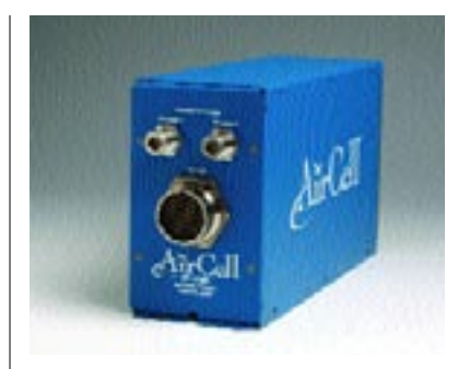
AirCell's ST 3120, two-channel Iridium SATCOM

The ST 3120 interfaces with the C-750 and C-2000 MagnaStar telecommunications units and cabin equipment and offers extensive installation flexibility. The company also stated that the new ST 3120 offers full accessibility to AirCell's various service providers including