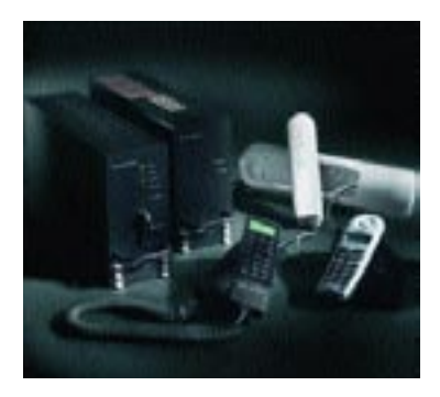
Thrane & Thrane Aero-HSD+

tions terminals, has introduced its new Aero-HSD+, a unique, multi-channel voice, fax and high-speed data solution, integrating both Aero-H+ and Swift64 Inmarsat services into one compact, lightweight unit. To provide optimum flexibility, the Aero-HSD+ offers secure and reliable data communications at speeds up to 64 kbps. This means that airborne executives can enjoy fast and cost-effective access to a variety of services including voice, e-mail, and the Internet. all while the flight crew maintains continuous contact with groundbased information systems.