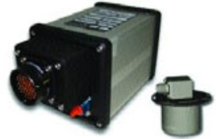
Shadin Co. ADAHARS

The system created for use with any EFIS display unit with ARINC interface and its fuel flow interfacing