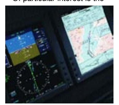
Rockwell Collins IDS-3000

IDS-3000. This unit provides biz aircraft operators with an easy and flexible way to replace current analog and CRT-based EFIS equipment with the latest in large-format LCD display technology increasing information availability and improving situational awareness. Among its many features, the IDS-3000 permits the display of electronic charts, enhanced maps, and real-time graphical weather, as well as integrating a variety of existing aircraft sensors, radios. flight management and autopilot systems.