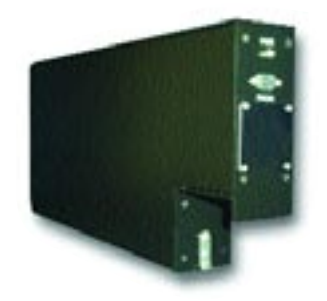
Audio International's SAT-100 / 200 Iridium communication system

Unlike other map applications that employ typically cumbersome disc-operated devices, the Atlas Server's hard drive allevi-