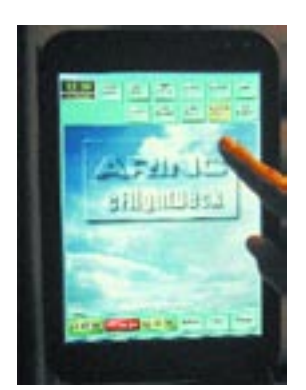
ARINC eFlight Deck

"eFlightDeck revolutionizes the management of onboard information by combining today's best-