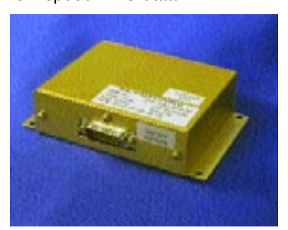
DAC's GDC34 ARINC 429 to RS-232 Converter

Now that you've got your EFB, you have to have a way to access the data from your aircraft's systems right? Well, check out DAC's new GDC34 ARINC 429 to RS-232 converter. The GDC34 has been created to provide a fast and easy interface between RS-323-based Electronic Flight Bags and the ARINC 429-based high-end systems on the majority of business aircraft. By providing this convenient link, the GDC34 provides the EFB with position, speed, track and other valuable information available through the aircraft's Flight Management System. Synchronizing FMS bus speeds and EFB formats is not a problem with the GDC34—with four available versions, the GDC34 can utilize either high- or low-speed FMS data.