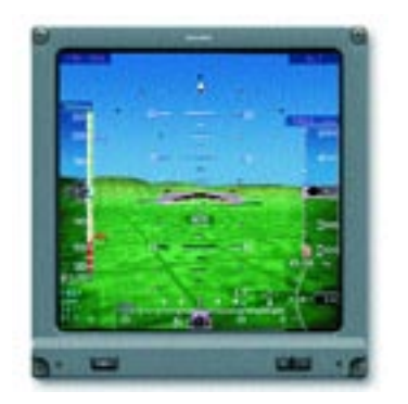
Universal Avionics' 890R Display Suite

If you're lucky enough to fly a turboprop or mid-size jet, you'll want to check into Universal's