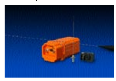
EMS 406-1 ELT Emergency Locator Transmitter

EMS Technologies took full advantage of the AEA spotlight to take yet another step in becoming one of the recognized leaders in airborne wireless technologies with the introduction of two new products: the CNX Cabin Network Xcelerator and the AMT-3800 high gain antenna. Designed to support the most stringent requirements of multi-channel Aero-H, Swift64 and emerging BGAN operations, the compact, fuselage mounted AMT-3800 allows the seamless delivery of these advanced services into the cabins of smaller business iets.