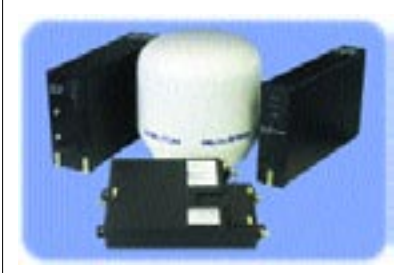
Chelton HSD-6000 High Speed Data SATCOM

For more information: www. cheltonsatcom.com