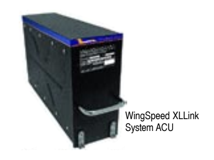
Continued on page 22...

"Advanced, low-cost, airground communications will allow the industry to realize