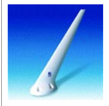
Comant's 2860 ComDat antenna

While they may seem to be very pedestrian, antennas are really becoming very cool tools. Take the new ComDat CI 2680-400 "combination antenna." For example, the CI 2680-400 encompasses what the ComDat concept is all about. It combines three separate antenna functions into one blade-style unit: GPS, satellite radio/weather uplink systems, and VHF communications.