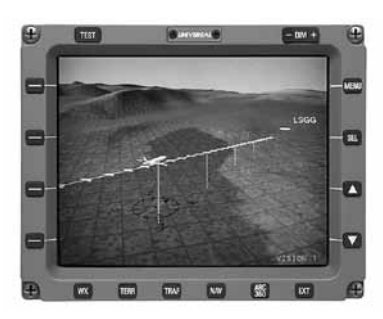
An exocentric view from Universal Avionics' Vision-1 SVS technology.

The view on the PFD needs to be seamless and consistent with the aircraft's position, making the display update rate an important consideration. The